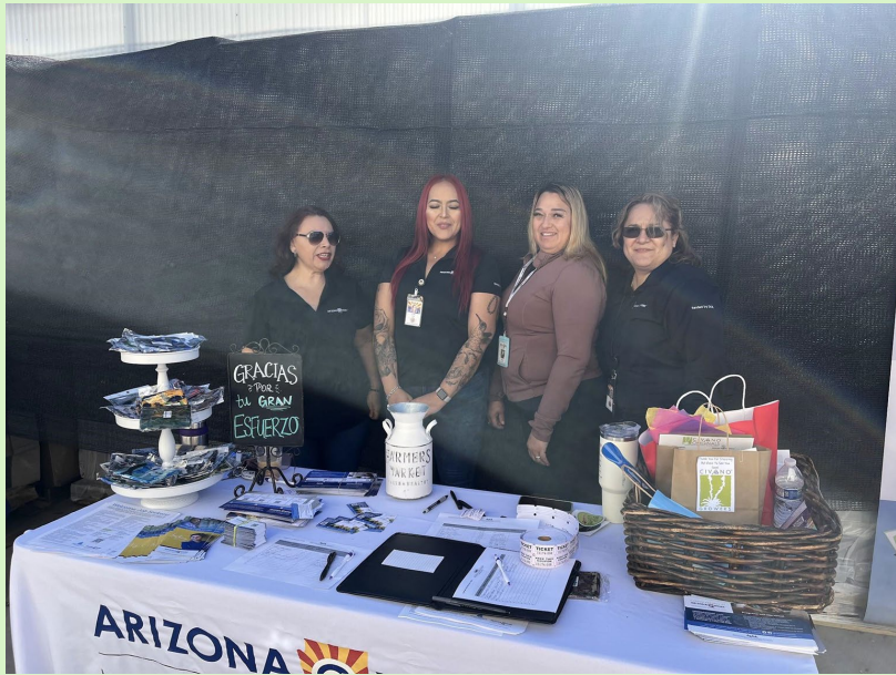
Pima County - Tucson, AZ