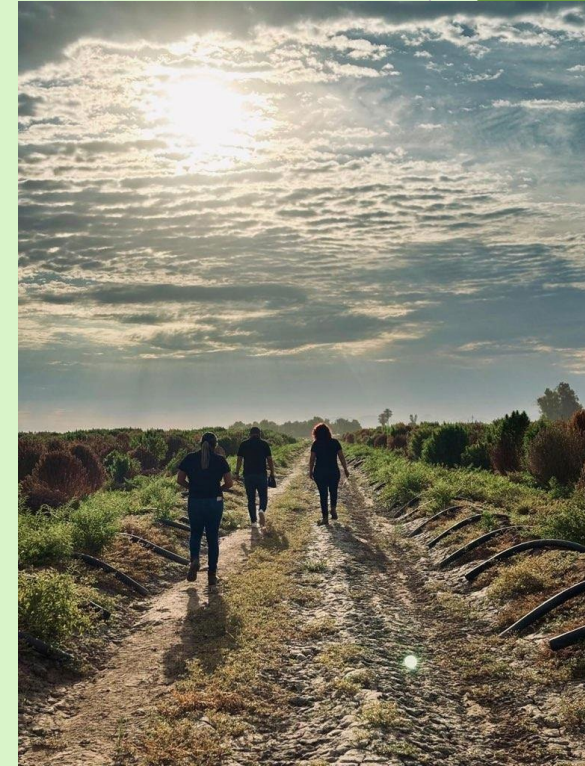
Yuma County - Yuma, AZ