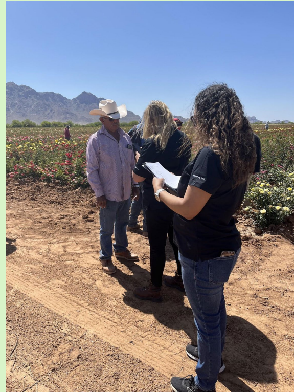
Pinal County - Eloy, AZ