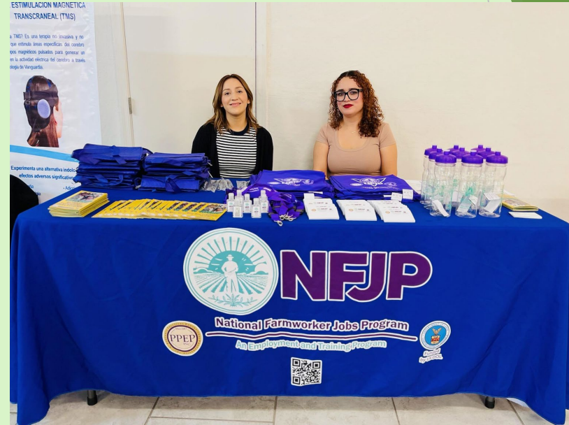
Yuma County - Somerton, AZ