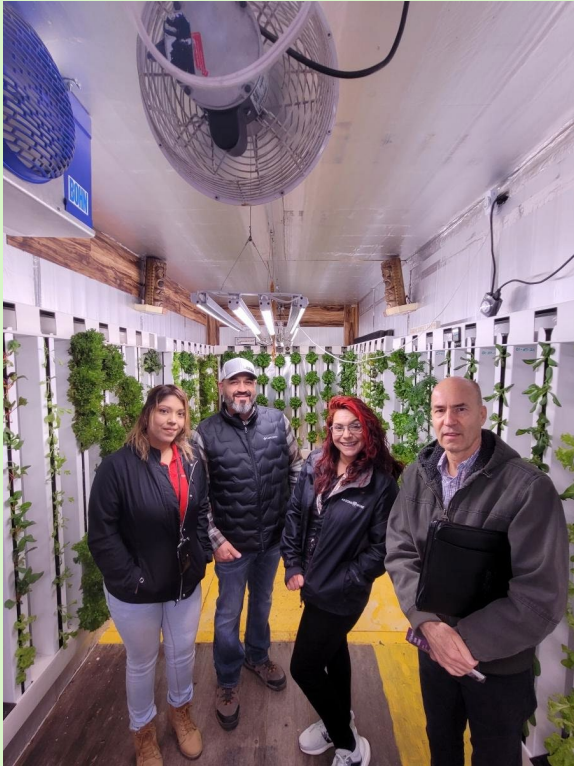
La Paz County - Parker, AZ