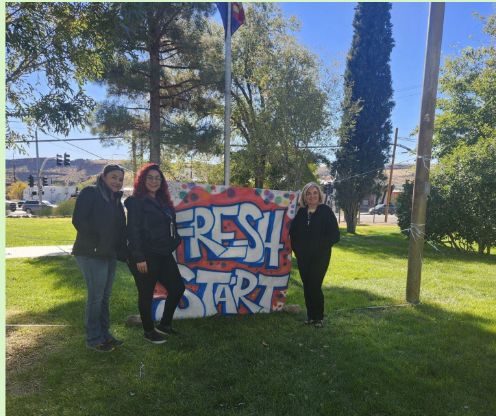
Mohave County - Kingman, AZ